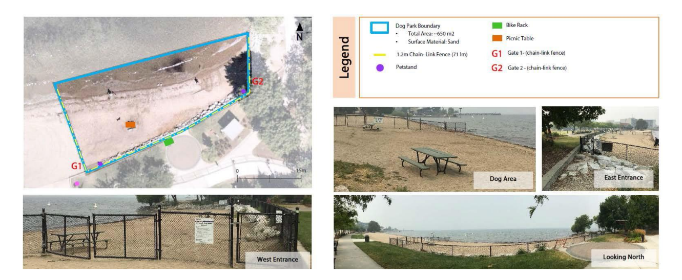
Appendix A – Okanagan Lake Beach Off-Leash Area – 45 Lakeshore Drive East -465m<sup>2</sup>