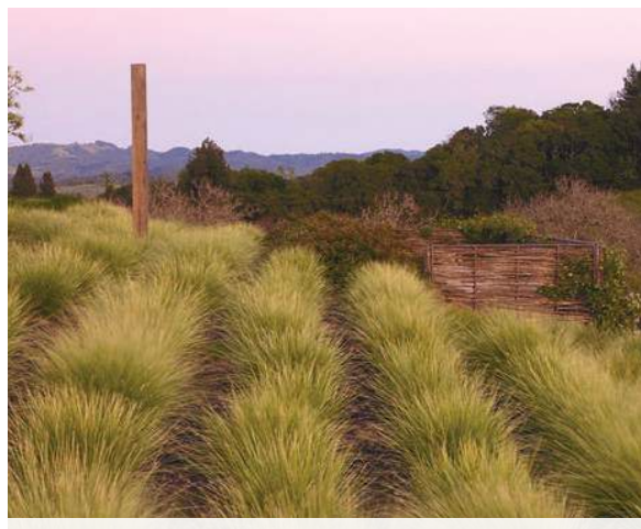
Low Plantings and Clear Lines of Sight

Crime Prevention Through Environmental Design (CPTED) principles will be applied to the design. The playground and spray park areas will remain fenced to protect