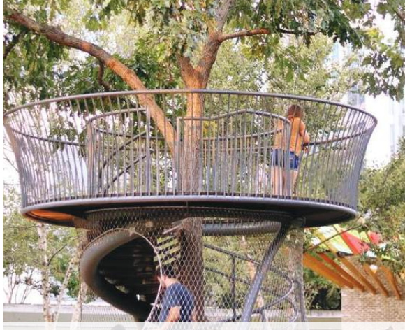
Lifting Play Above Tree Root Zones

Urban forests are recognized as an important element of both human comfort and ecosystem services within communities. Lakawanna Park, including the playground area, has exceptional mature tree specimens that are recognized by the community as once of its most valuable assets.