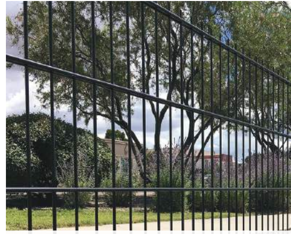
Visually Permeable Fencing

Safety is a primary consideration for this playground. Problems of after-hours vandalism and anti-social behaviours in the park have been identified; the use of the existing washroom by non-playground users and the homeless population is a particular concern of many parents and caregivers.