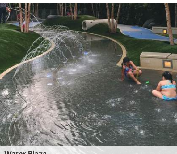
Water Plaza

The entries to the playground have been reconfigured to prioritize visibility and safe community connections. The Lakeshore Drive entry is more direct and offers clear views into the main playground area, as well as new bike parking and a welcoming picnic plaza and lawn area. The entire playground will be fenced with low and visually permeable fencing. The south playground entry, set back from the road, has been reconfigured to provide a safer connection to the parking area, reducing children's exposure to street traffic in both the Phase 1 interim condition and at the build-out of Phase 2.