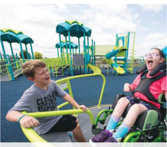
Accessible Play Equipment

Accessibility and universal design are identified priorities for the City's public spaces, including parks and playgrounds. Accessible playground design specifically considers the needs of children with physical and sensory disabilities, providing spaces and elements that can be navigated by wheels and walkers, or experienced by touch and sight. Because children and their caregivers have varying ages and abilities,