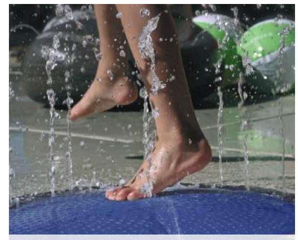
Weight-activated Water Play

The suggested year-round opening of the washroom on the west side of the building, along with welcoming improvements to this small washroom plaza, would discourage non-playground users from using the washroom in the playground's interior. The