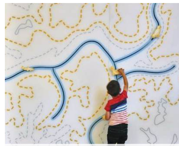
Interactive Play Elements

The playground redesign should foster creativity both in its design and use. Play elements that support creative and social development will be emphasized, such as interactive panels, natural play elements, and spaces to hide, perform, and visit. Visual, aural, and tactile stimulation will all be considered in play equipment,