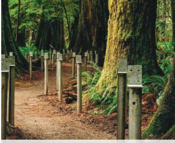
Low-Impact Footings (Pre-Boardwalk Installation)

The use of permeable materials will be maximized to allow rainwater infiltration, and new tree plantings will be added where possible. Tree root zones will be protected