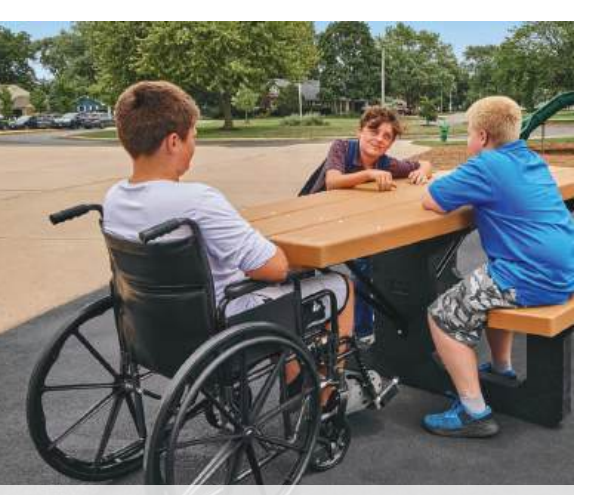
Accessible Furniture

While play equipment is the primary draw to the playground, various types of small and medium-sized gatherings are common uses and functions identified by the community. Caregivers may need or want comfortable or accessible seating options, while daycare groups and young families may wish for tables for a play date or small birthday party.