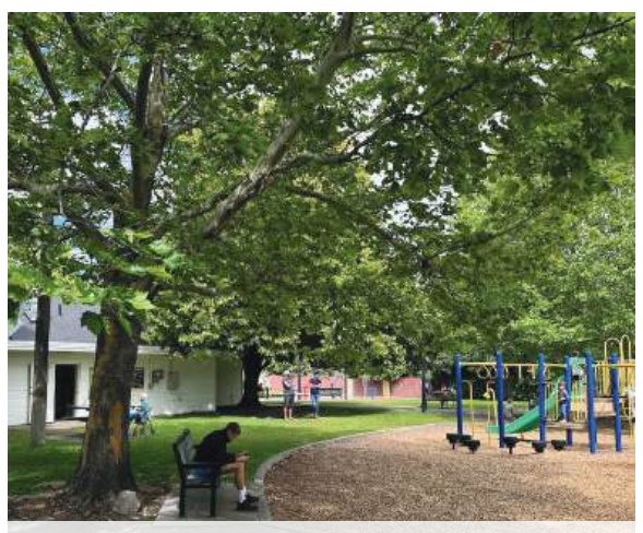
Existing Park Trees

W URBAN FOREST & SUSTAINABILITY All existing trees will be maintained, except a single tree that was identified as unhealthy in the arborist's review. The protection of these trees and their root zones is prioritized with the use of permeable materials (rubber safety surfacing and bark mulch) and sensitive construction (hand work and low-impact footings). Additional trees will be added to the playground to further build the canopy.