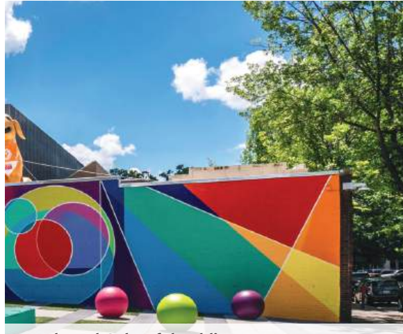
Murals and Colourful Public Art

In addition to re-locating the existing sculpture within the playground, opportunities for incorporating new public art will be suggested. Vertical surfaces, such as fences and the south exterior wall of the cafe and the washroom building, offer great