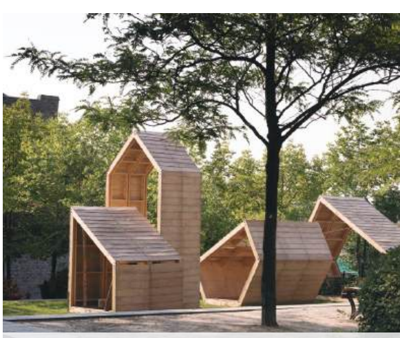
Open-ended & Creative Play Opportunities Photo credit: Atelier Pierre Thibault

The playground redesign should foster creativity both in its design and use. Play elements that support creative and social development will be emphasized, such as interactive panels, natural play elements, and spaces to hide, perform, and visit. Visual, aural, and tactile stimulation will all be considered in play equipment,