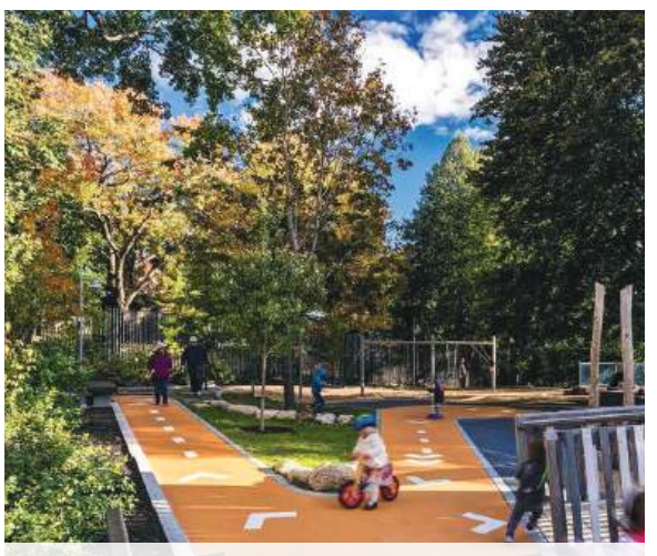
Pathway Materials for Feet, Wheels, & Walkers

attention will also be given to playgroundrelated infrastructure, including safe access from the adjacent parking area, accessible washroom availability, and comfortable seating types and locations. Accessible circulation routes and play surfacing, along with play equipment that can be used by children with disabilities or mobility aids, will be a priority.