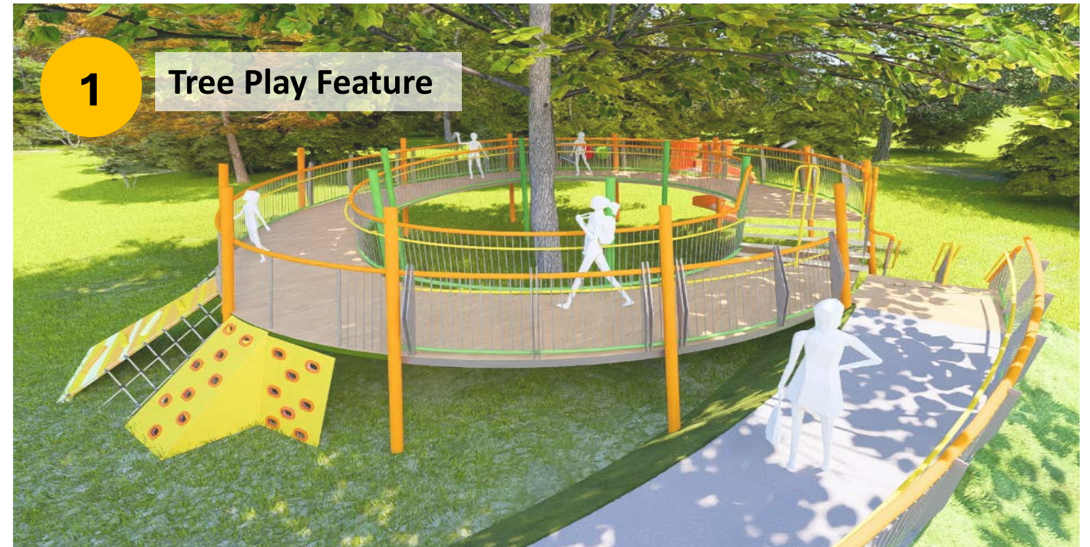
1 Tree Play Feature