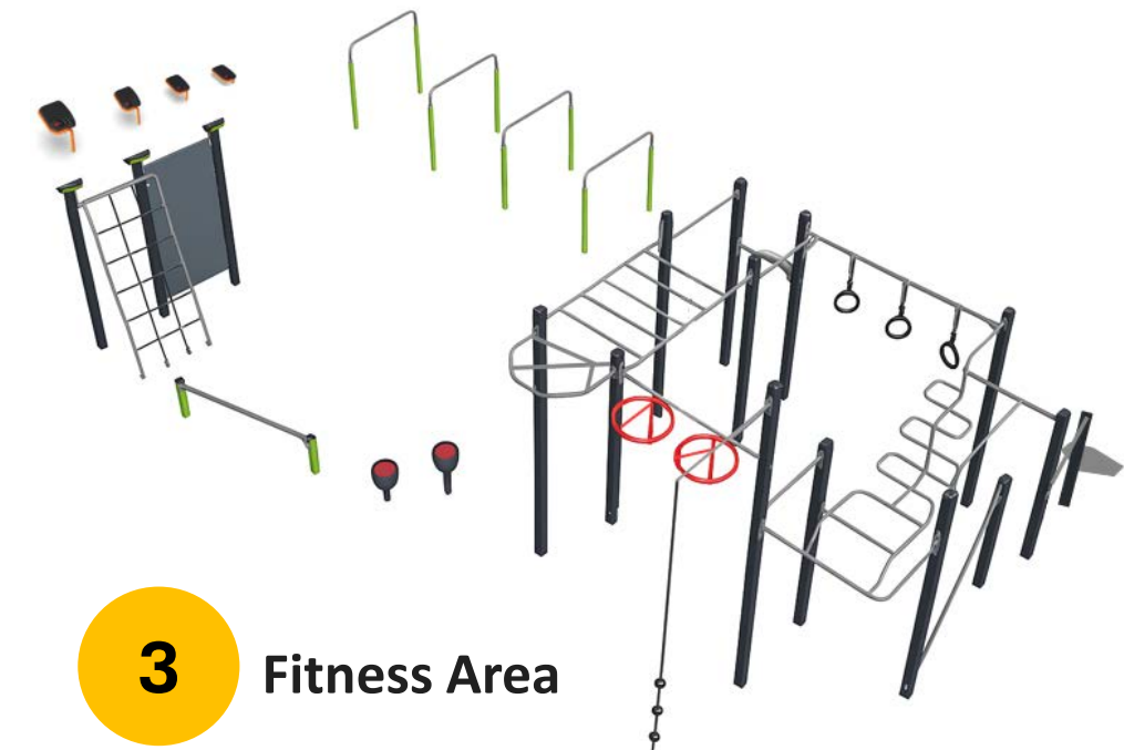
3 Fitness Area