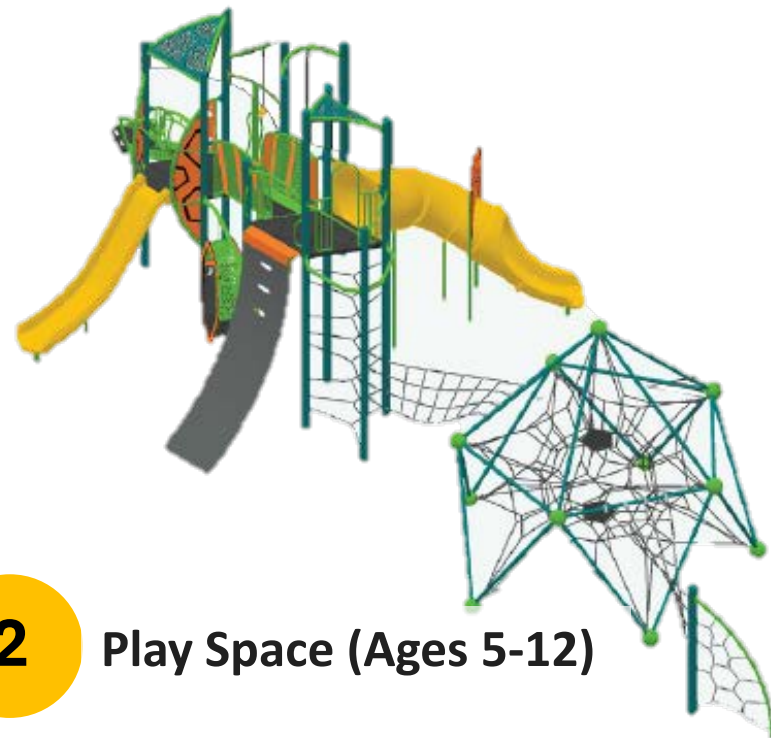
2 Play Space (Ages 5-12)