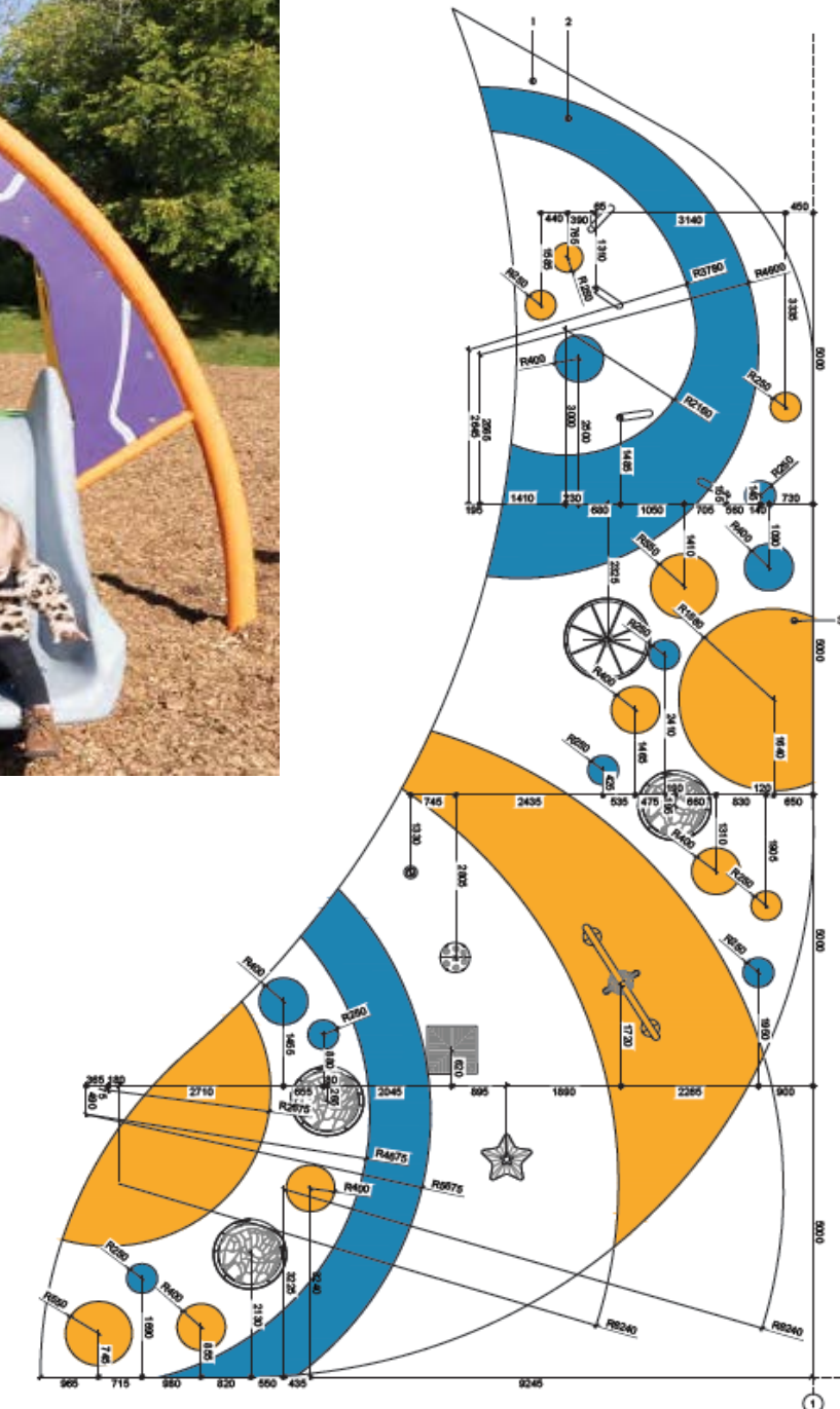
5 Swing Set (All Ages)