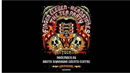
The Tea Party, Headstones & Finger Eleven | Nov 25