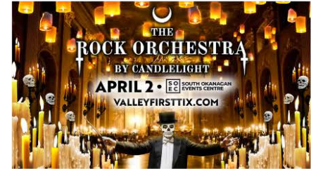
The Rock Orchestra by Candlelight | Apr 2