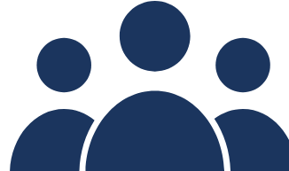
Full-Time Salaried 38 Positions