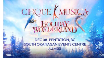
Cirque Musica Holiday Wonderland | Dec 8