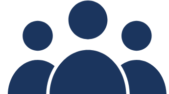
Part-Time Hourly 511 Positions

Part-time hourly positions are within Food & Beverage, Operations, Housekeeping, Box Office, Marketing, and Events Departments. Generally utilized event-by-event, though some positions work full-time hours.