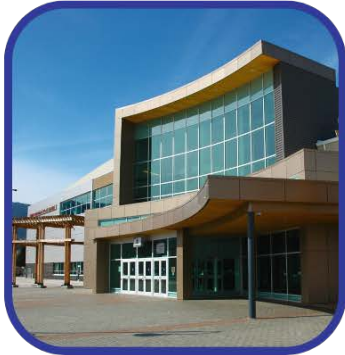
SOUTH OKANAGAN EVENTS CENTRE

The SOEC Complex is managed under contract by Oak View Group. The budget includes these four facilities: