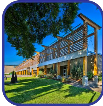
PENTICTON TRADE & CONVENTION CENTRE