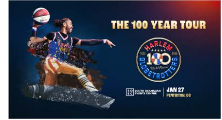
Harlem Globetrotters | Jan 27