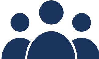
Department Directors 8 Positions