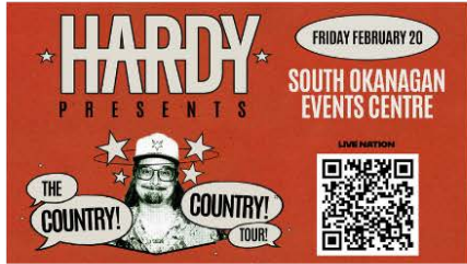
HARDY - THE COUNTRY! COUNTRY! TOUR! | Feb 20