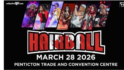
HAIRBALL | Mar 28