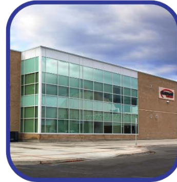
OKANAGAN HOCKEY TRAINING CENTRE