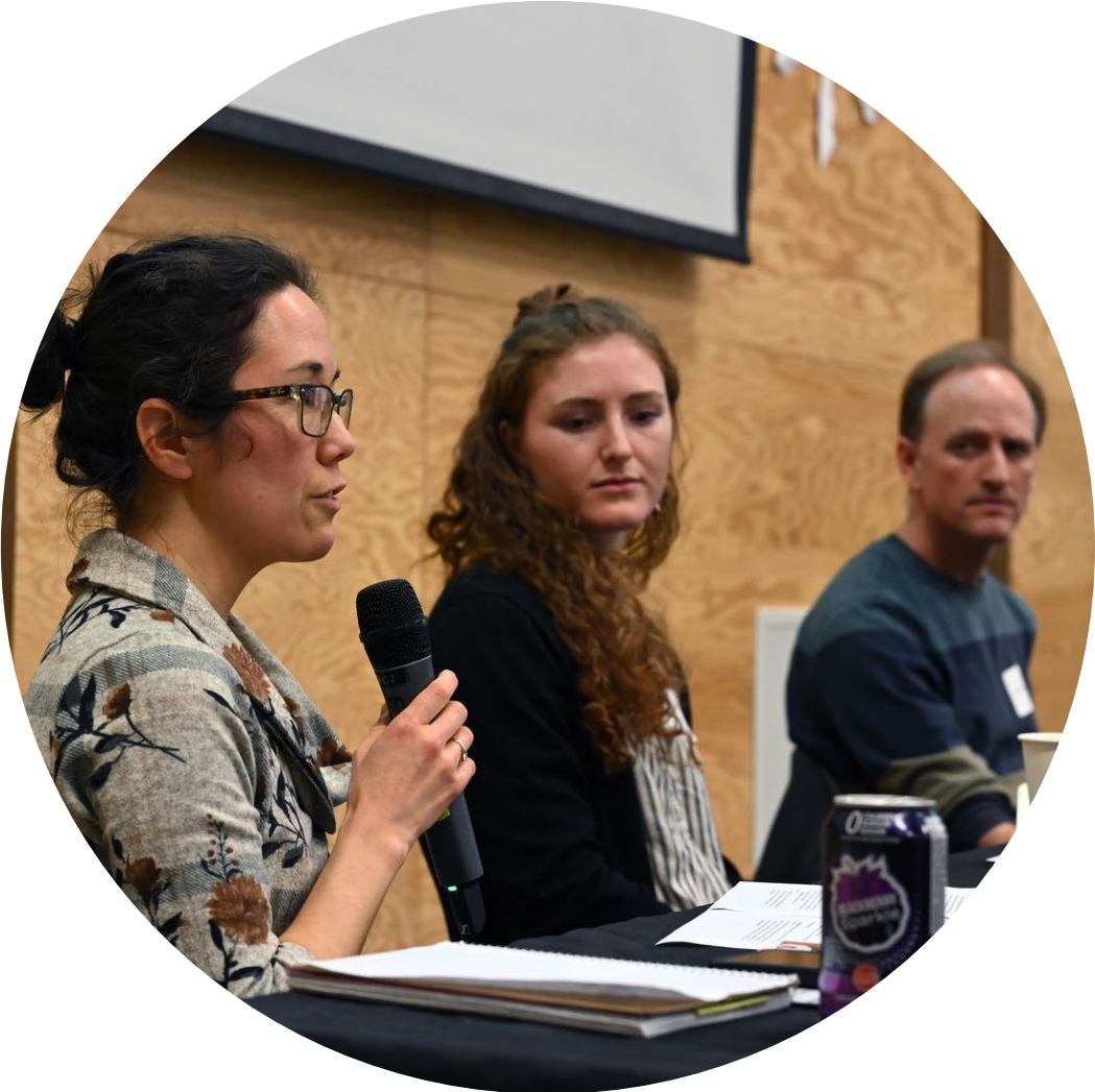
Food Security Panel at the Vital Signs Launch Event in Penticton