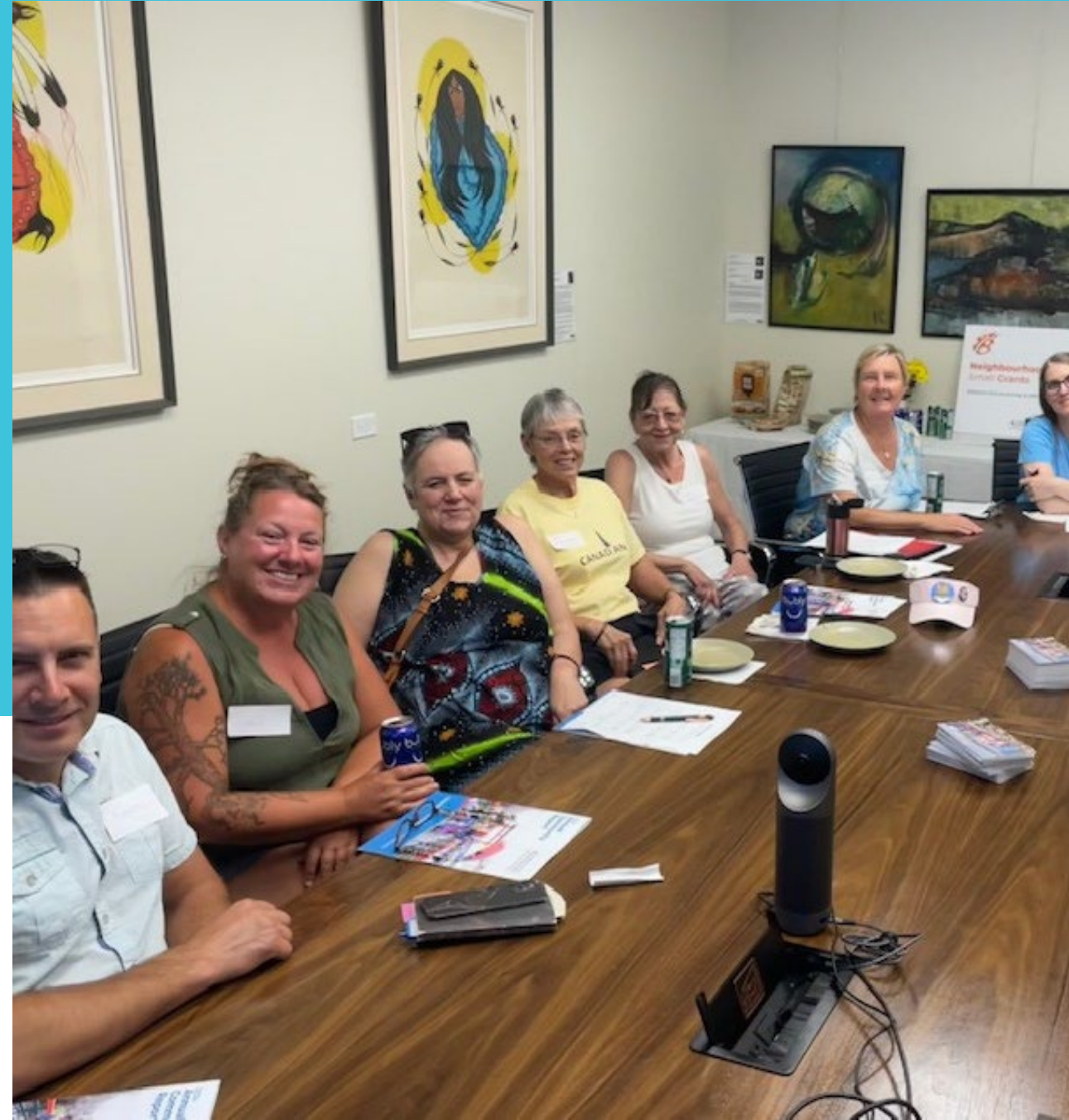
NSG Penticton 2025